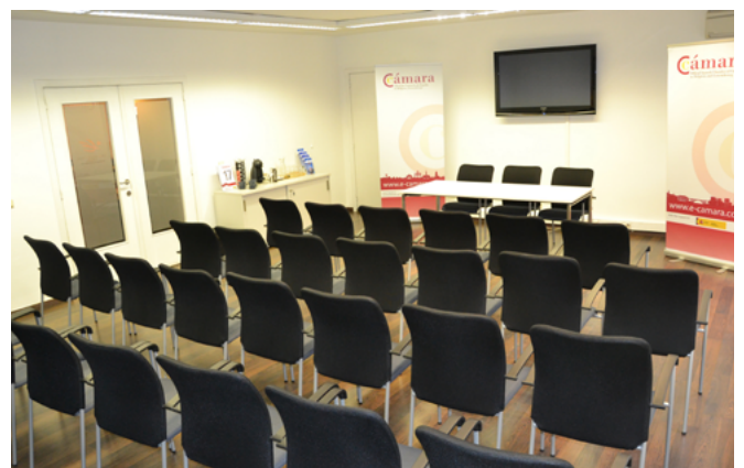
Assembly setup (up to 40 people)