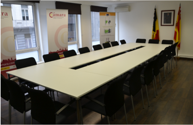
Conference setup (up to 24 people)