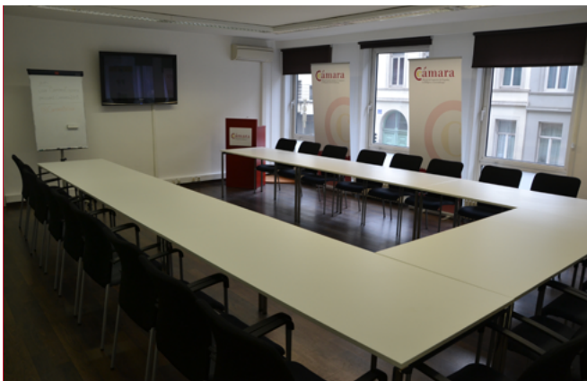
U-Shape setup (up to 23 people)