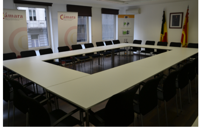
Conference setup 2 (up to 28 people)