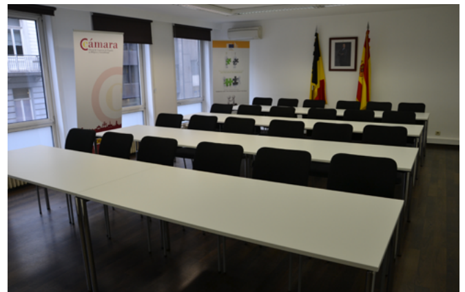
Classroom setup (up to 24 people)